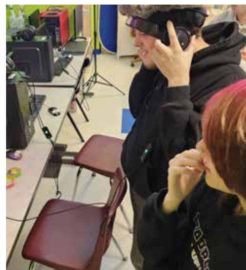
Excited about the additions to the Music and Media Lab