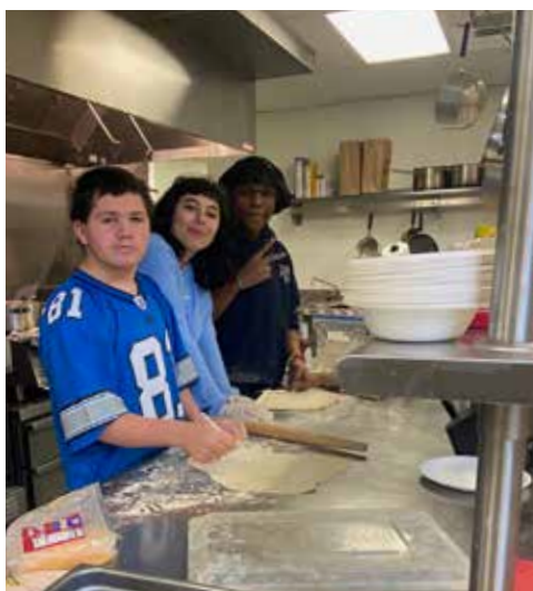
Delicious food being created in the Culinary Program