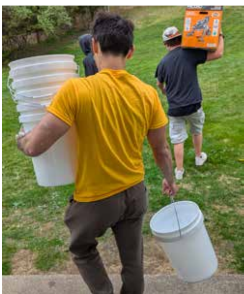
Preparations underway for the car detailing service