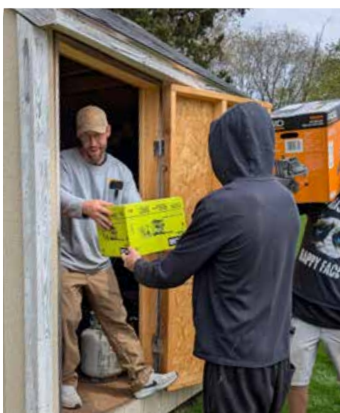
Organizing car washing and detailing supplies