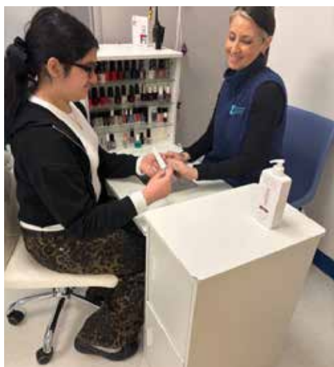
Hands-on learning never looked so polished

This exciting addition to the vocational program is a direct result of the Foundation's investment and support, and it is impossible to fully measure the impact it has already had—and will continue to have—on our students in the months and years ahead.