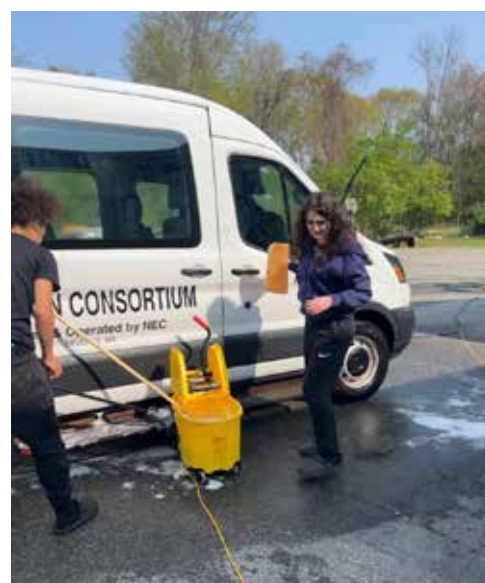
Students eager to test out the new equipment