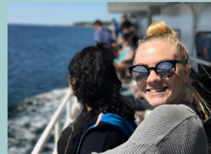
Recovery High students took to the water for a Whale Watch. They also spent time making art, including pottery as seen below.