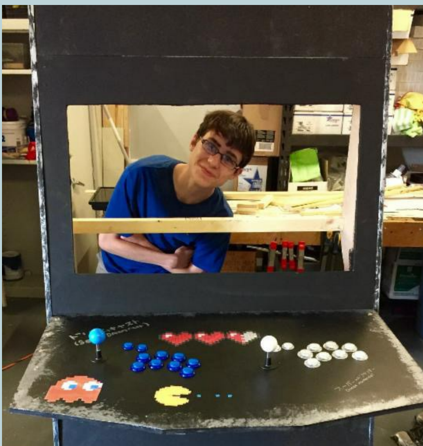
NSAU students created a classic arcade video game player.

Students at the Northshore Academy Upper School designed, built and programmed a trio of retro arcade game cabinets this summer. The project involved three phases, each integrating areas of high student interest and incorporating job skills. The first step was to design and build an arcade cabinet. While the art department decorated the exteriors, the arcade team worked on the brains of their systems. They loaded a trio of Raspberry Pi computers with the RetroPie Operating system and loaded them up with classic arcade games, including Super Mario, Donkey Kong and Street Fighter. Once the control panels were decorated, the arcade team began wiring the controls. They created two two-player systems and one four-player system, each individually wired with backlit LED buttons. The final week, students mounted the televisions and applied the final touch ups to the cabinets.