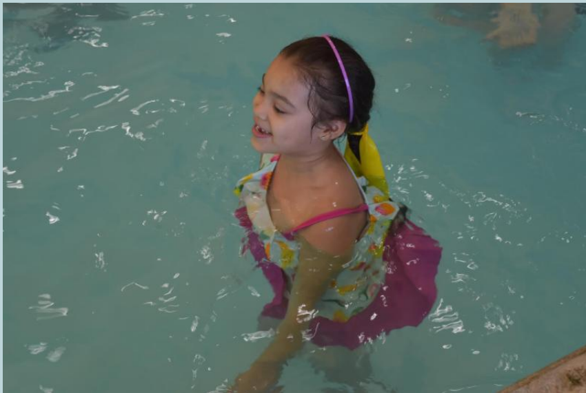
Northshore Academy Lower School students went swimming twice a week at the Beverly Athletic Club.

Northshore Recovery High School staff, students and parents/guardians collectively agreed that summer school should be spent finding ways to engage students in opportunities to enhance learning, while also offering students the experience of having fun without the use of mind-altering substances -- "sober fun," as the students often say. Students were able to enjoy kayaking, paddle boarding, canoeing, sailing, yoga and meditation, while also accessing recovery supports both in school and the local community. Students enjoyed the opportunity to learn new ways to add to their recovery "tool-kits." These positive activities helped to build a strong recovery community throughout the summer in preparation for the new school year.