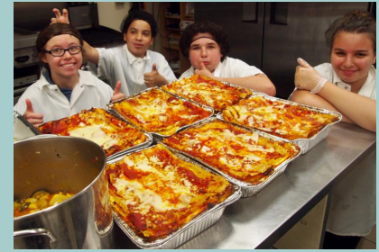
The Voc Academy's culinary students made lasagna, always a big favorite.

Students at the Topsfield Vocational Academy, our newest program, enjoyed a day at Crane Beach in Ipswich.