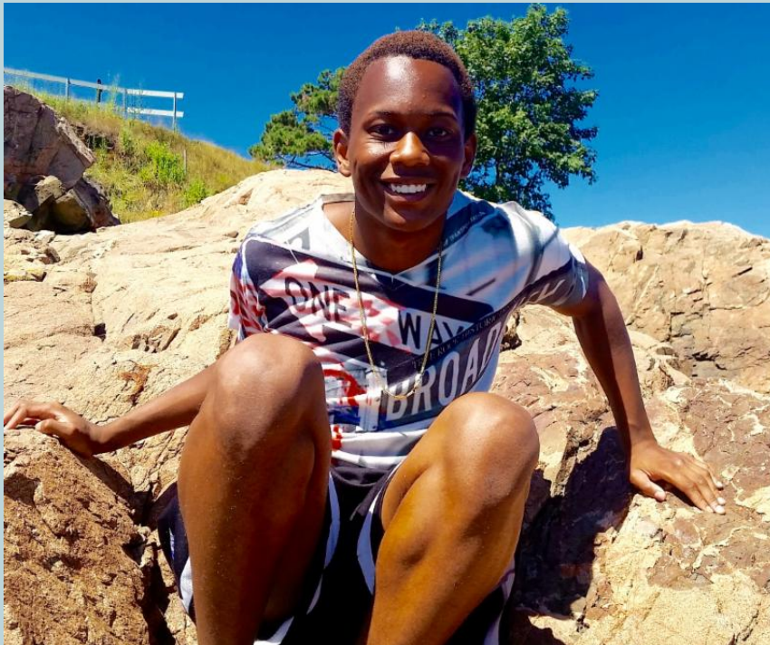
Embark students enjoyed hiking at Misery Island.