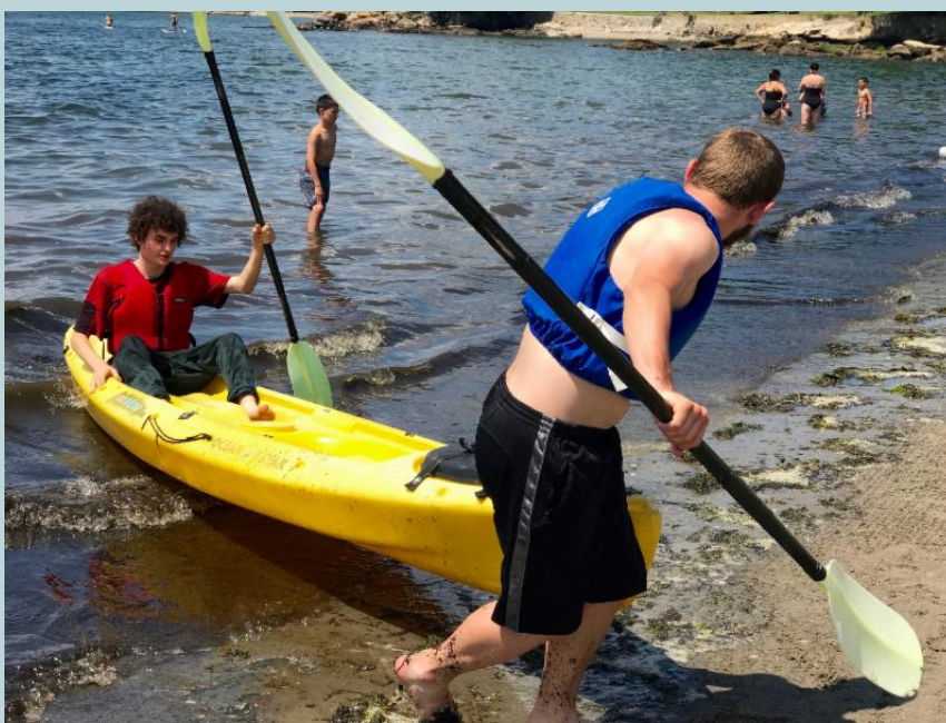
Recovery High School students enjoyed kayaking.

Northshore Recovery High School staff, students and parents/guardians collectively agreed that summer school should be spent finding ways to engage students in opportunities to enhance learning, while also offering students the experience of having fun without the use of mind-altering substances -- "sober fun," as the students often say. Students were able to enjoy kayaking, paddle boarding, canoeing, sailing, yoga and meditation, while also accessing recovery supports both in school and the local community. Students enjoyed the opportunity to learn new ways to add to their recovery "tool-kits." These positive activities helped to build a strong recovery community throughout the summer in preparation for the new school year.