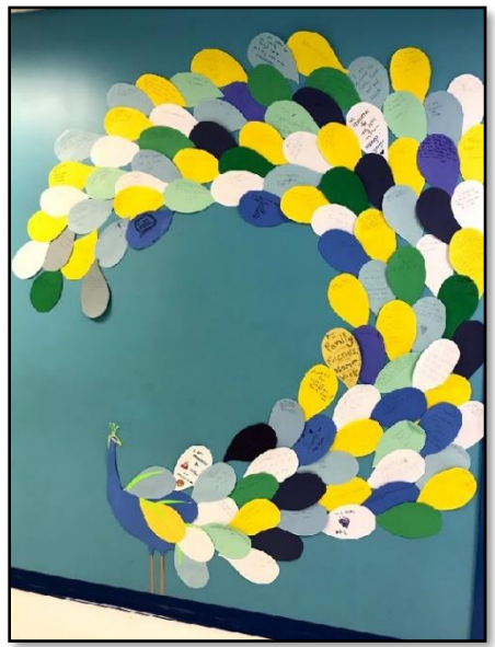
The NSA gratefulness peacock.